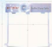
Made in the U.S.A.

APPLICATION AVAILABLE IN A FREE STANDING AND INTERIOR WALL MOUNT SYSTEM